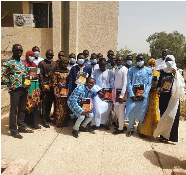
Burkina Faso Training, 2021

The LEGS Handbook was first published in 2009, with a second edition in 2015. The third edition will be published in 2023. LEGS draws on evidence-based good practice from around the world, which is incorporated into the Handbook, training materials and other resources. The LEGS organisation is a non-profit entity registered in the United Kingdom, managed by a Board of Trustees and supported by a small central secretariat. It also has a technical Advisory Group made up of experts from FAO, ICRC, ODI, Sphere India, and Tufts University. For more information, visit livestock-emergency.net .